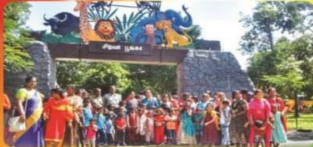
Early Intervention Center for Autism Children Poonamallee