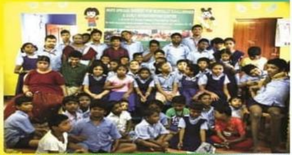
Hope Special School for Intellectually Disabled Children, Ambattur