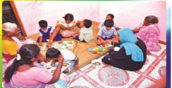
Early Intervention Center Ambattur (0-5yrs) for MR Children-Ambattur