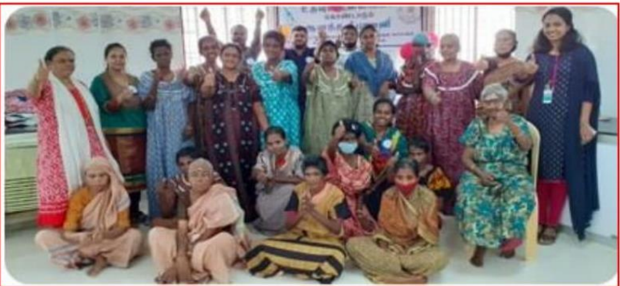
HOPE PSYCHIATRIC REHABILITATION SHELTER FOR WOMEN(MI)