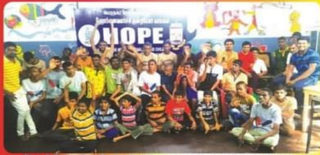
Care & Protection Center for Abandoned Special Children Aminjikarai